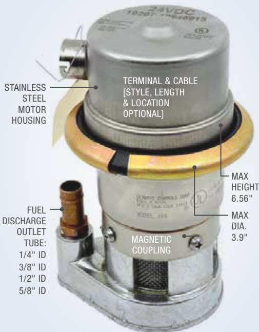
ASK ABOUT OUR CUSTOMIZED OPTIONS AVAILABLE FOR YOUR PRODUCT LINE.

We are a proven legacy-run product specialist partner ready to fulfill your sourcing requirements. Reach out at info@occorp.com to discuss how our professional team can be of service to you.